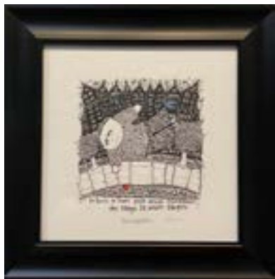
“The Things I’ll Never Forget” Second Place Ink on Bristol $125