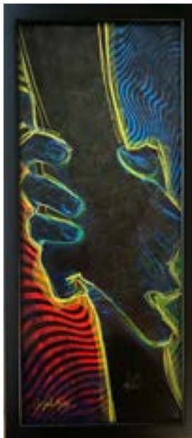
“Hold On” Frist Place Digital $150

James and Debra Tobin are also participating in the show with digital and fiber art pieces.